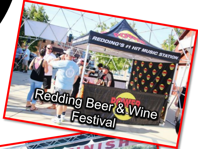
Redding Beer & Wine Festival