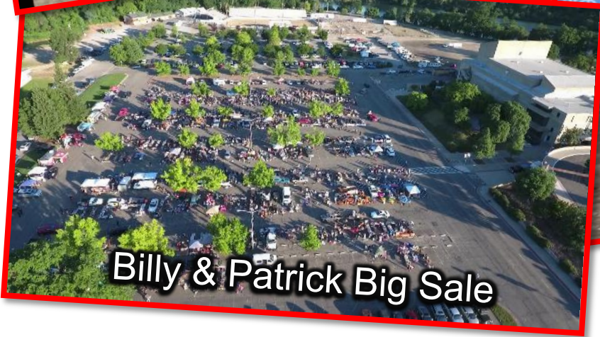
Billy & Patrick Big Sale