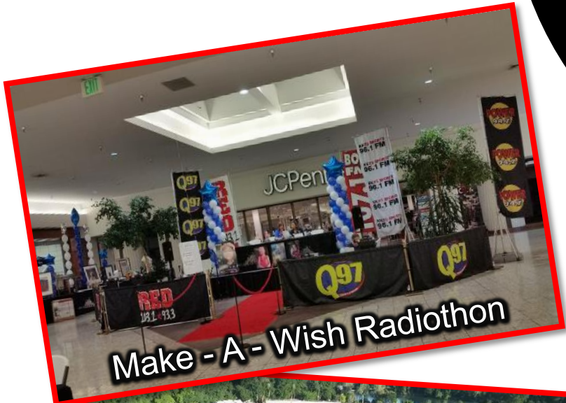
Make - A - Wish Radiothon